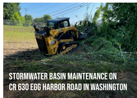
STORMWATER BASIN MAINTENANCE ON CR 630 EGG HARBOR ROAD IN WASHINGTON