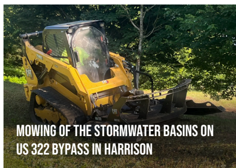
MOWING OF THE STORMWATER BASINS ON US 322 BYPASS IN HARRISON