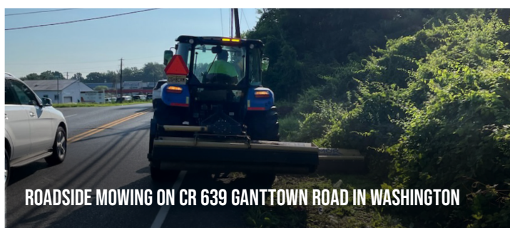
ROADSIDE MOWING ON CR 639 GANTTOWN ROAD IN WASHINGTON