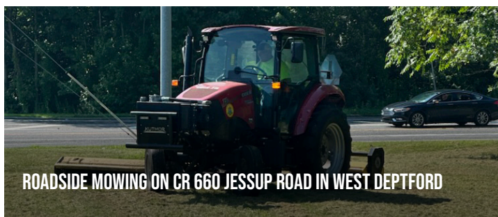
ROADSIDE MOWING ON CR 660 JESSUP ROAD IN WEST DEPTFORD