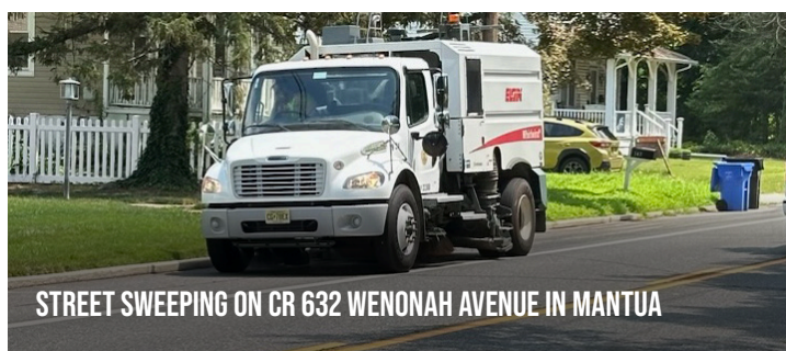
STREET SWEEPING ON CR 632 WENONAH AVENUE IN MANTUA