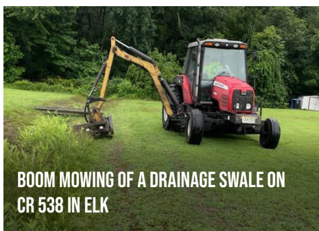
BOOM MOWING OF A DRAINAGE SWALE ON CR 538 IN ELK