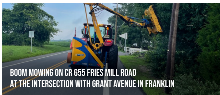
BOOM MOWING ON CR 655 FRIES MILL ROAD AT THE INTERSECTION WITH GRANT AVENUE IN FRANKLIN