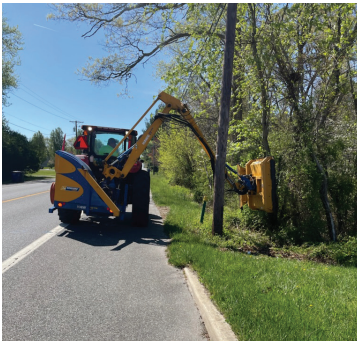
Boom mowing on CR 555 Tuckahoe Road in Monroe.

This machine helps reshape drainage ditches along the edge of roads while also helping cut down on weeds growing in and adjacent to the drainage ditches.