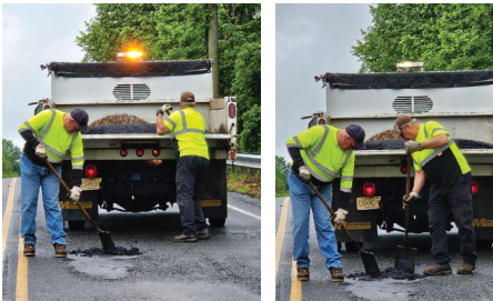
Pot hole repairs on CR 551 Kings Highway in West Deptford.

Maintaining Our Roadways Continued from page 4