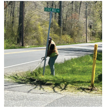
Weed whacking and mowing at the intersection of CR 538 Swedesboro Road and Little Mill Road in Franklin.