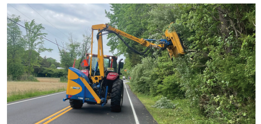
Boom mowing being performed on CR 607 Tomlin Station Road in South Harrison.