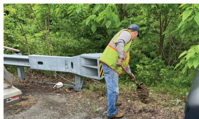
Shoulder maintenance being performed on CR 705 Woodbury Turnersville Road in Washington Township.