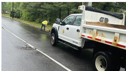
Inlet cleaning being performed on CR 634 Fish Pond Road in Washington Township.