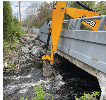
Debris removal at a bridge on CR 615 Malaga Park Drive in Franklin.