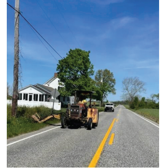
Ditch maintenance being performed on CR 694 Monroeville Road in South Harrison.

This machine helps reshape drainage ditches along the edge of roads while also helping cut down on weeds growing in and adjacent to the drainage ditches.