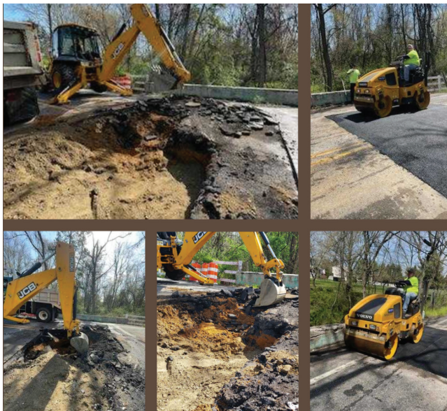
Sinkhole repair on CR 581 Commissioners Road in Harrison Township.