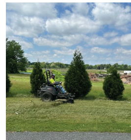
Mowing and weed whacking at the CR 715 Salina Road roundabout in preparation of the senior picnic in Deptford.