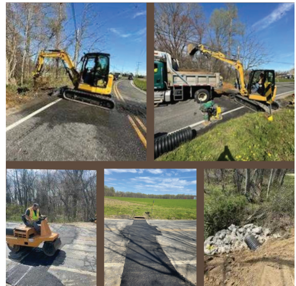
Installation of new HDPE storm pipe following collapse of old pipe during storms.