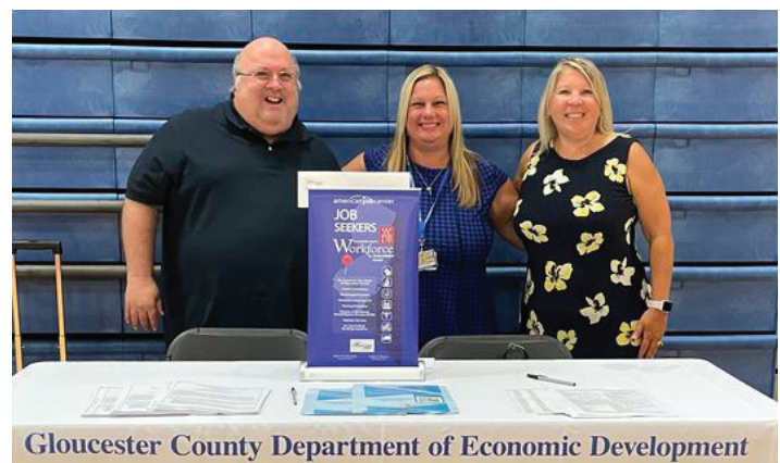
Staff from the Gloucester County American Job Center on hand to assist and inform job seekers at the 2023 Gloucester County Disability Employment and Resource Job Fair.