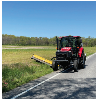
Roadside mowing being performed on CR 637 Academy Street in Elk.