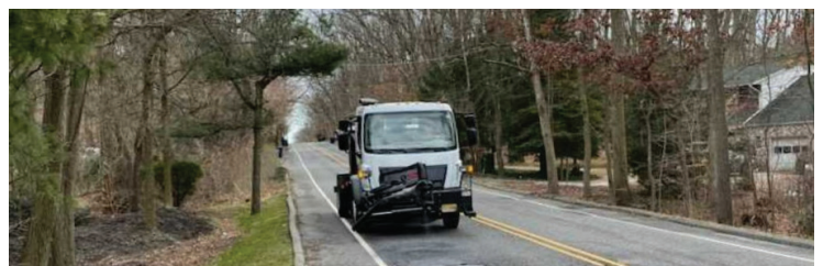
Pothole repairs on CR 626 Heritage Road in Mantua