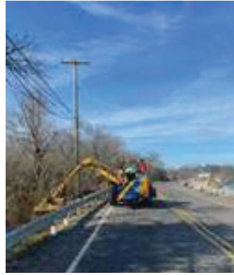
Boom mower in action on CR 613 Porchtown Road near Iona Lake in Franklin Township