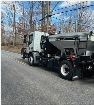
Patch truck at work on CR 667 Cedar Road in Harrison Township; pothole patrol on CR 678 Mount Royal Road in Mantua Township