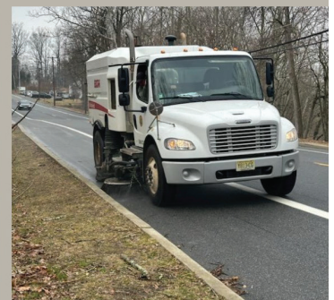
Boom mower at work on CR 610 Clayton Williamstown Road near Fries Mill Road in Clayton; sweeper truck adding a sparkle to CR 632 Wenonah Avenue/ Mantua Avenue in Wenonah and Mantua