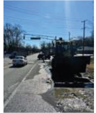
Filling shoulder with millings at the intersection of CR 621 County House Road and SR 41 Hurffville Road in Deptford