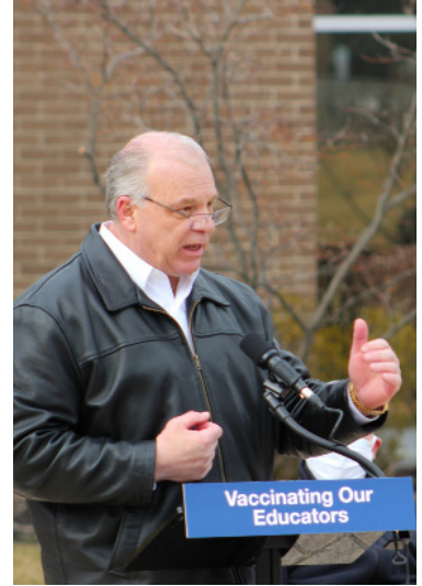
Senate President Steve Sweeney announced vaccination expansion for teachers and other essential personnel at RCSJ.

For more information on the Mega Site, how to register and updates please visit www.gloucestercountynj.gov