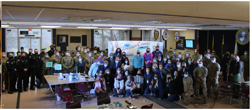
Gloucester County celebrated their 100,000 vaccination on Sunday, February 28, 2021.